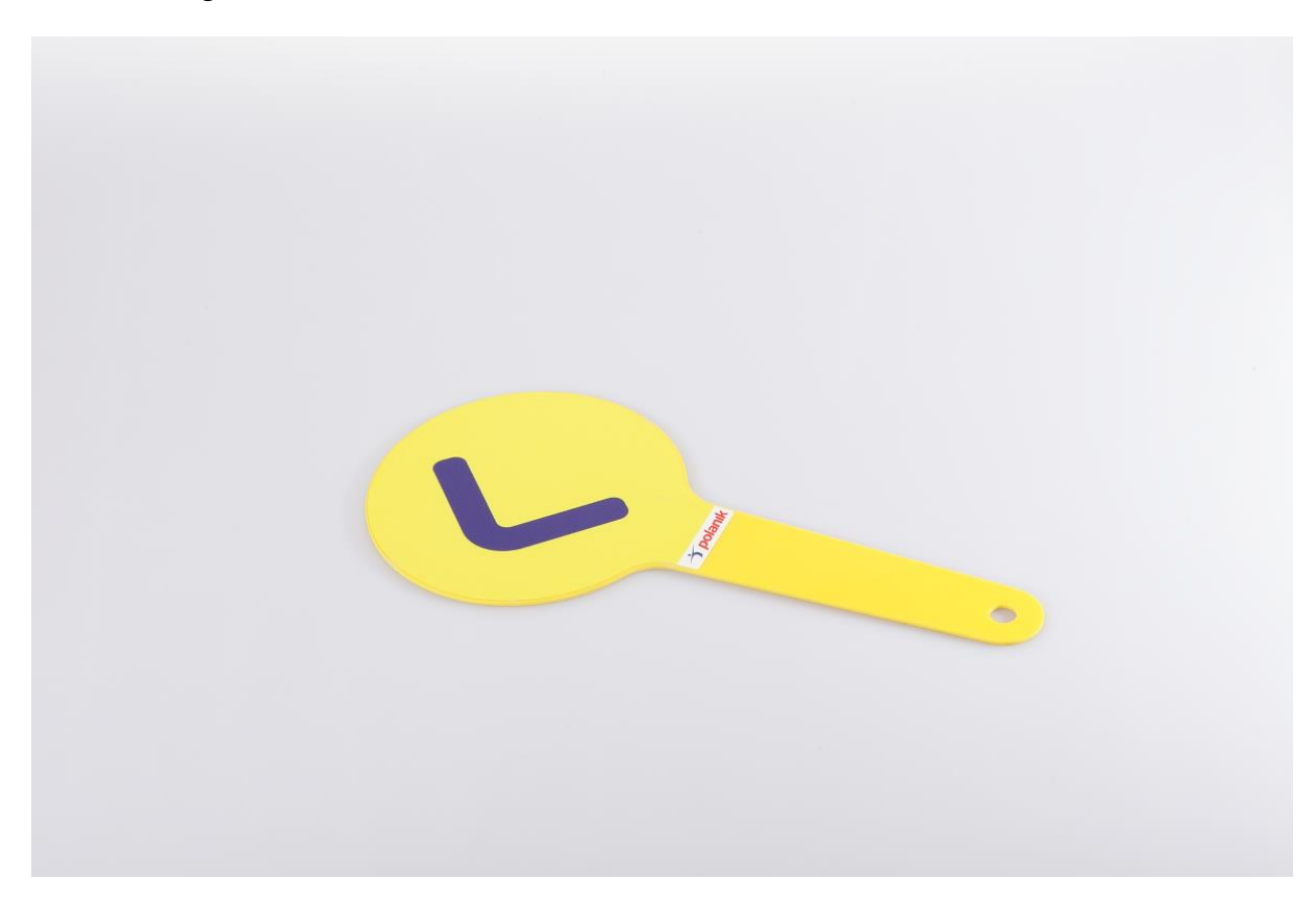
TSC-BK © 2016 Polanik

The producer reserves the right to introduce without warning changes in product constructions and colours.